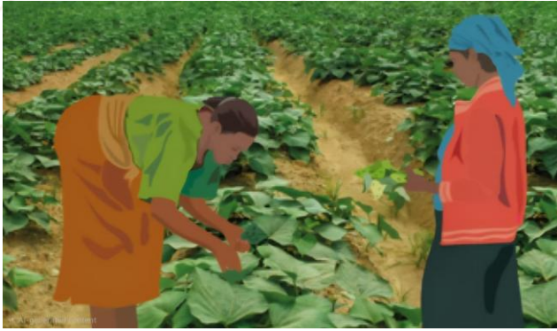
Inspecting the crop for visual symptoms.