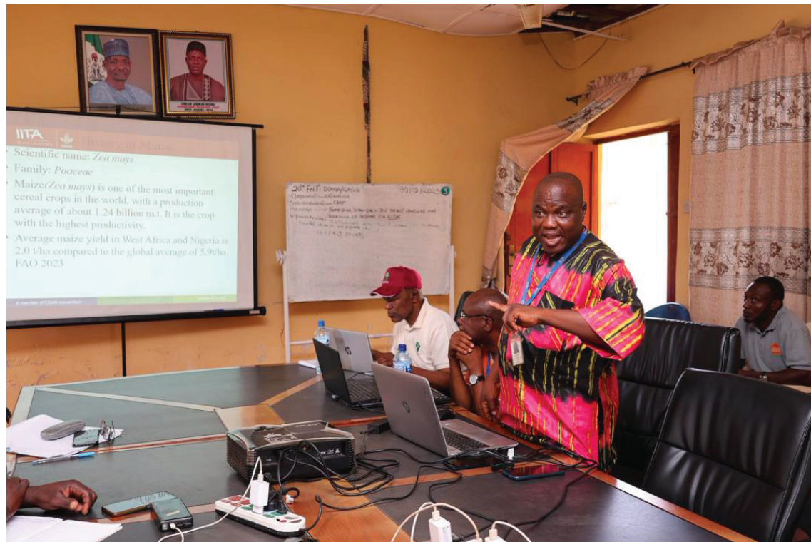
one of the facilitators at the ToT in Nasarawa, Nigeria

In October 2025, experts from IITA, the Sasakawa African Association (SAA), and the SoftBank (e-kakashi) consortium delivered a targeted Training of Trainers (ToT) for extension agents and lead farmers at project sites in Nasarawa State.