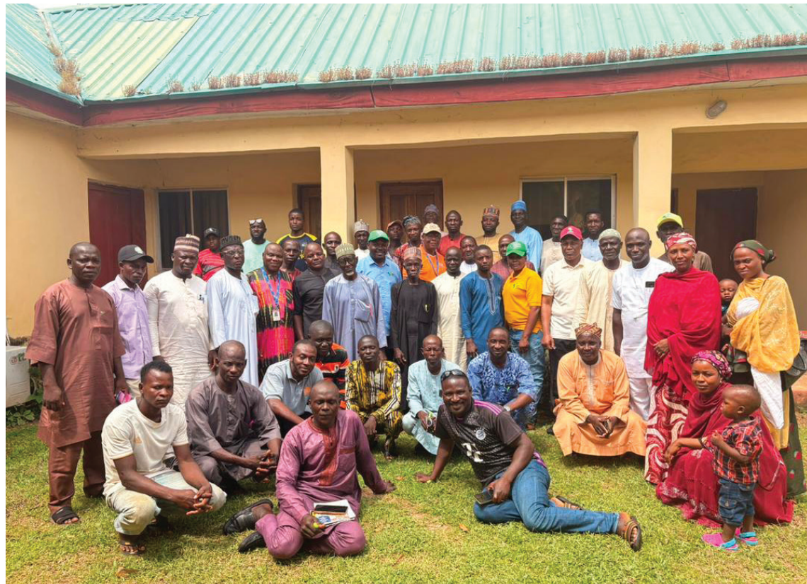
A group photo of the participants at the ToT in Nasarawa state, Nigeria