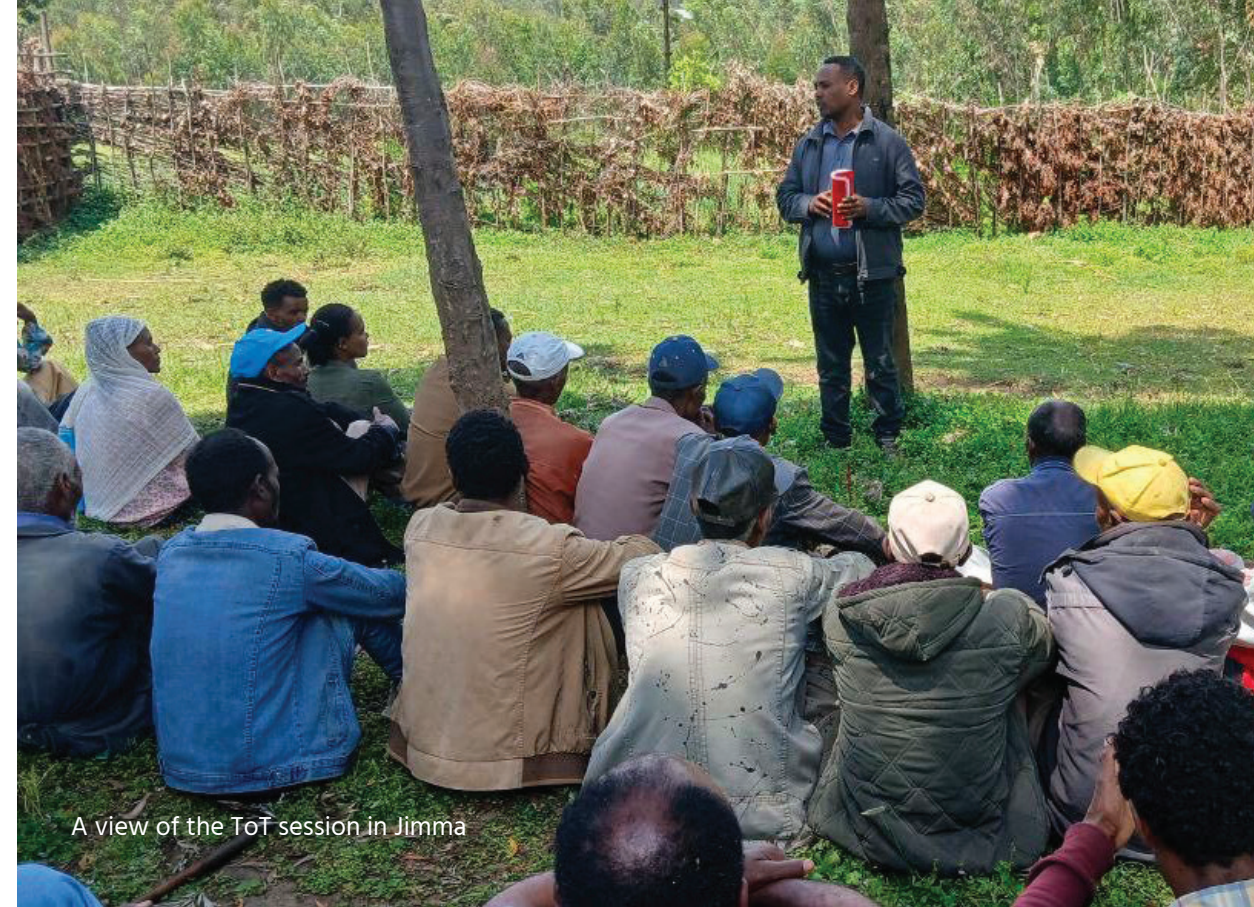
A view of the ToT session in Jimma