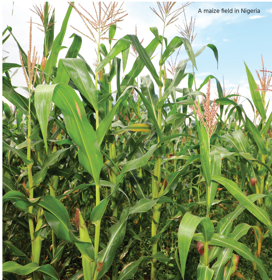
A maize field in Nigeria